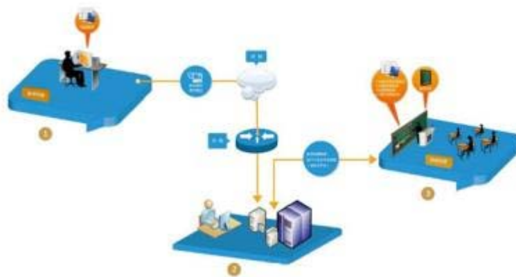
Figure 2. Schematic diagram of ITS system

collaboration, conversation and other elements of the learning environment to give full play to students' initiative, enthusiasm and initiative, and ultimately achieve to enable students to construct current knowledge of the purpose of effectively. In the traditional teaching mode, the four elements of the role and status and the traditional mode of teaching composition compared to the corresponding change, the students are no longer passive recipients of knowledge teaching, and become the active construction of teachers, the teaching process control change for the organizers of the teaching process, guidance, students construct the helper and promoter: knowledge teaching is no longer teachers to teach, and students take the initiative to construct the object becomes; media teaching is teachers to help complete teaching task tool change in order to help the students to take the initiative to learn learning, active exploration of knowledge tools. This new teaching model for learners provides more expansive learning environment, so that they can give full play to their creativity, imagination and the spirit of exploration, learning is no longer a passive, boring behavior, and become independent and full of fun[3].